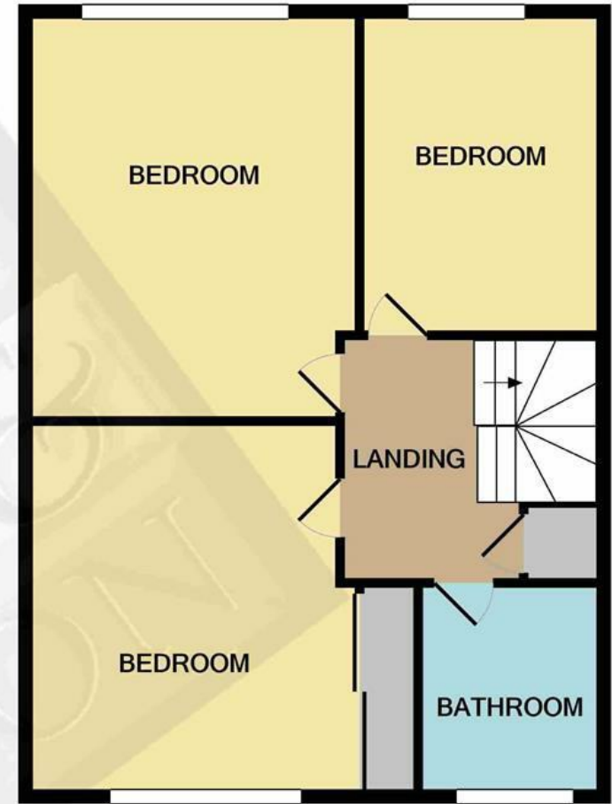
1ST FLOOR APPROX. FLOOR AREA 513 SQ.FT. (47.7 SQ.M.)

TOTAL APPROX. FLOOR AREA 1334 SQ.FT. (123.9 SQ.M.)