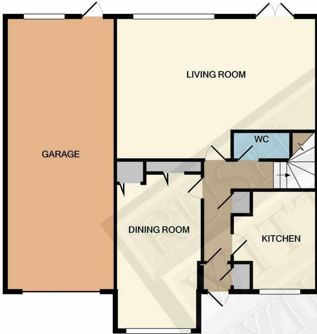
GROUND FLOOR APPROX. FLOOR AREA 821 SQ.FT. (76.3 SQ.M.)